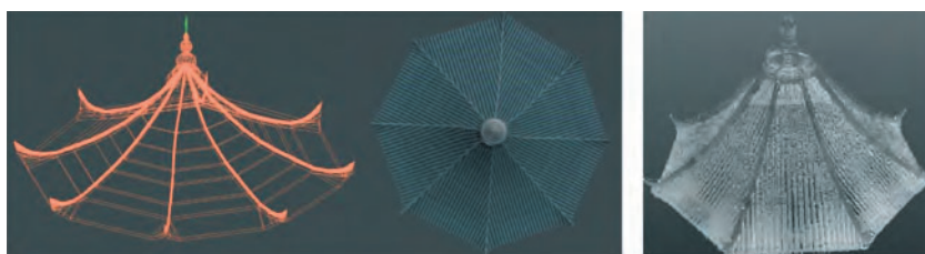
▲ Figure 2: Two views of the 3D models of the roof of the Liuhe Pagoda (left) derived from a laser scanning point cloud.