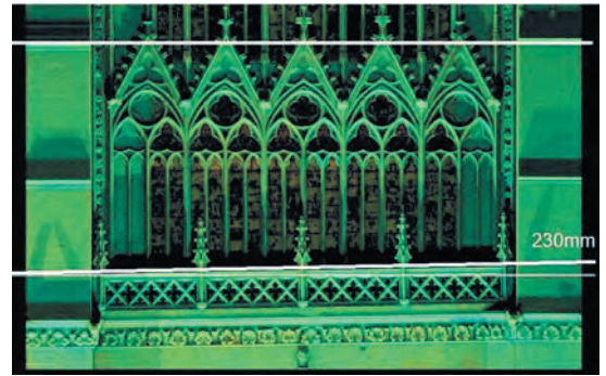
▲ Figure 6: Misalignment of the balcony of the south facade of Notre-Dame Cathedral in Amiens.

TLS has come a long way since the late 1980s. Performance and productivity have greatly increased, while the cost of ownership, size and weight have decreased. TLS is not yet fully mature, however. Manufacturers still recommend a yearly calibration to maintain the specifications. Standard warranty periods are just one year, whereas two years is