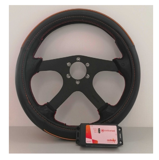
Fig. 1. CardioWheel for collecting drivers' electrocardiogram and lead on detection signals.

After filtering and windowing the electrocardiogram signal in time periods where the lead on detection signals indicate contact, the peaks within QRS complexes (the combination of three graphical deflections seen on a typical electrocardiogram) are located and the heart rate measurement is obtained from the time elapsed between successive pairs. The sequence of successive time intervals between heart beats – the Inter Beat Interval (IBI) – is then used to compute heart rate variability features at two-minute intervals of the collected data. This feature set contains time, frequency and non-linear domain heart rate variability variables, from simple means and standard deviations of heart rate and IBI values, to spectral power in very low, low and high bands, and Poincare plot axis lengths. Heart rate variability features are then used in a support vector machine (SVM) for further analysis. SVM is a machine learning algorithm that splits the data into two classes by finding a hyper-plane separating those two classes and maximizing the distance between that hyper-plane and the closest data points from each class. These data points are called support vectors and their position ultimately define the classification decision. The selection of support vectors is achieved by minimizing the below cost function: