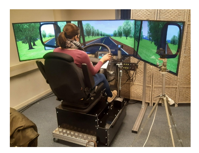
Fig. 3. DriveSimSolutions truck simulator in Hasselt University, Belgium.

each simulation frame, simulation variables were combined with data from external sensors and stored to a log file, thus data sampling rate was identical to the simulator frame rate at a frequency of around 30 Hz. To account for small variations in frame rate, timestamps (with 0.1 µs precision) were included in the log file. Externally, an i -DREAMS gateway was used to interface with the driving simulator and forward sensor data from the CardioWheel.