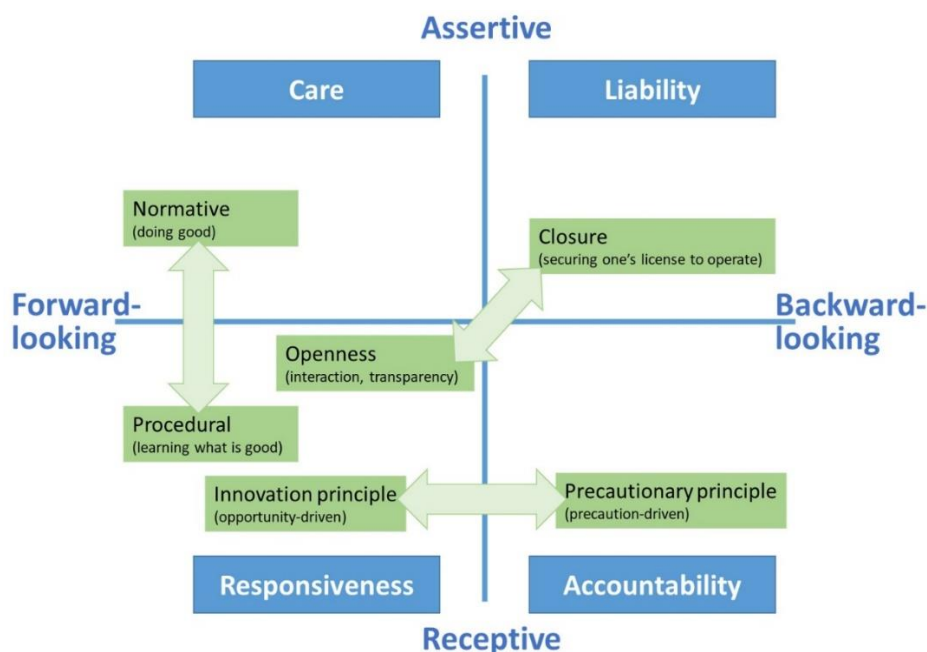
Figure 2. A meta-responsibility map for inventorying responsibilities in R&I projects.

elements, Figure 2 proposes a meta-responsibility map for R&I. It portrays three major dynamics derived from the case study data between the responsibility elements: accountability–responsiveness, care–responsiveness, and liability–responsiveness.