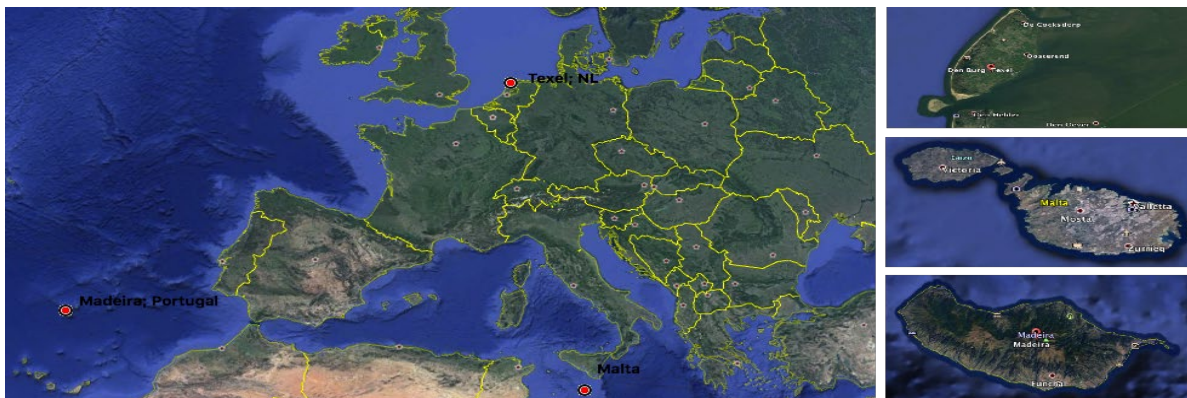
Figure 1. The islands Texel, Madeira, and Malta (from above to below); [using Google Earth].

Therefore, three islands spread over the EU continent were chosen: Texel in the Netherlands, Madeira in Portugal, and Malta (see Figure 1.). Because these islands are situated in sea areas under pressure of aggressive weather and water related conditions, there are climate-change programs on these islands in operating the stimulation of awareness under the local residents. Their relatively small size fosters the researchers' local scientific contacts to sustain the results during the research progress.