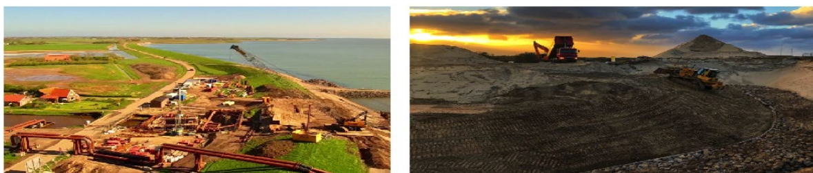
Figure 4. Reconstruction Texel’s East side sea-dike [right], and pump capacity [left].

According to the HHNK Waterauthority [in Dutch, HHNK stands for Hoogheemraadschap Noorderkwartier], responsible in the area for maintaining the safety of the island, the outside sea-related defence system and the inner island quantity and quality water situation, the reconstruction of the east side sea-dike has started in 2019 and, therewith, the capacity of the polder pumping stations was started to be upgraded [ https://www.hhnk.nl/waddenzeedijk ] (see Figure 4.).