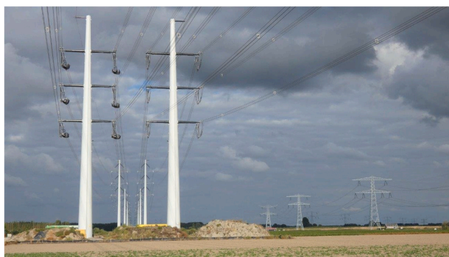
Fig. 4. Wintrack and Lattice pylons.

Interestingly, questions around the suitability of Wintrack pylons remained, especially within the planning and engagement team. When, in a later stage of the project, a window of opportunity opened up (amongst others because of changes in TenneT’s executive management), the team again raised the issue both within TenneT and with the Ministry of Economic Affairs and Climate. The Ministry asked for a proper analysis of the suitability of the pylons – and with this request, the team was able to include the recurring demands of the SO and work studio participants. Eventually, the results of the analysis pointed towards the development of different lattice mast for this particular project, called Moldau (See Fig. 4). The more so, the use of such masts has now become common practice within TenneT.