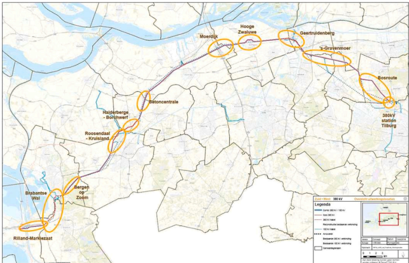
Fig. 3. Twelve areas along the route which required further optimisation.