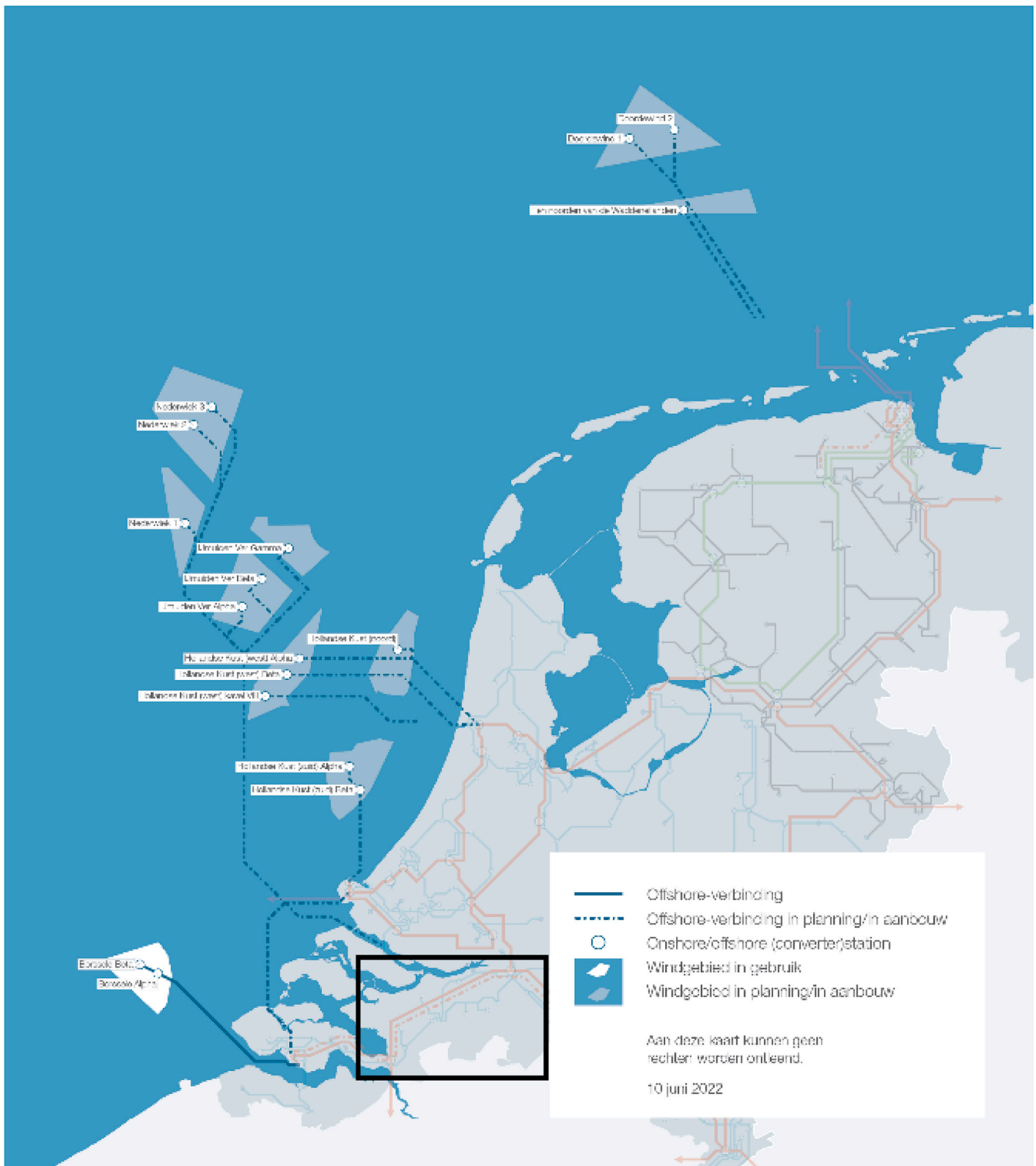
Fig. 1. Location of the transmission route connecting the offshore wind farms, through the province of Zeeland towards the city of Tilburg. Source: https://www.tennet.eu/nl/projecten/offshore-projecten-nederland , accessed 19-01-2023.

to be a main impulse for a series of events that resulted in a different approach to stakeholder engagement and, eventually, the re-establishment of trust among all parties.