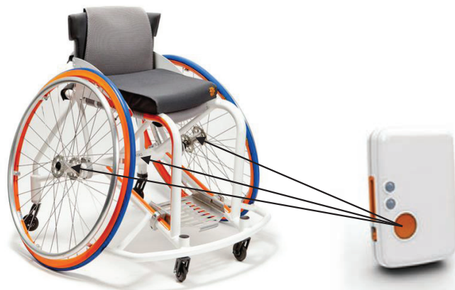
Figure 1: Sensor mounting locations on the wheelchair

The study was approved by the ethical committee of the Department of Human Movement Sciences (ECB-2014-2) Vrije Universiteit Amsterdam. All participants signed an informed consent after being informed on the aims and procedures of the experiment.