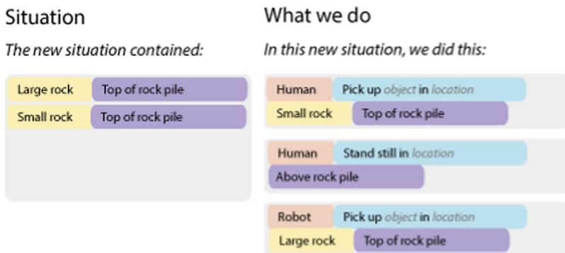
Fig. 2. An example Collaboration Pattern and accompanying Pattern Condition in the GUI. The user selects context-factors from colored blocks and drags them into the left grey area (“Situation”) to define the contextual conditions of the CP, and into the right grey area (“What we do”) to define the actions constituting the CP. The description portrayed is the example mentioned in Sect. 3, ‘Alternating actively working on the task and waiting for a team member’.

The GUI descriptions of the Collaboration Patterns were coded in two different ways: (1) correct, incorrect or semi-correct when compared to CP descriptions made by the researchers prior to the experiment, and (2) open coded based on how the descriptions were built up. The verbal clarifications were used to understand what participants meant in case their CP descriptions made with the GUI were unclear. They were also used to explore what aspects of the ontology, GUI and approach can be improved.