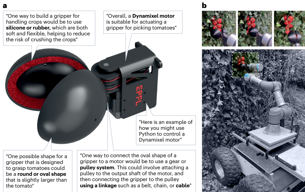
Fig. 2 | An AI model designed this robotic gripper. a , Some of the technical suggestions generated by the LLM, including shape indications, code, component and material selection, and mechanism design. b , Guided by these inputs, a gripper was built and tested on real-world tasks, such as tomato picking, as shown at right.

takes place. The full conversation with ChatGPT supporting this case study is provided in the Supplementary Information.