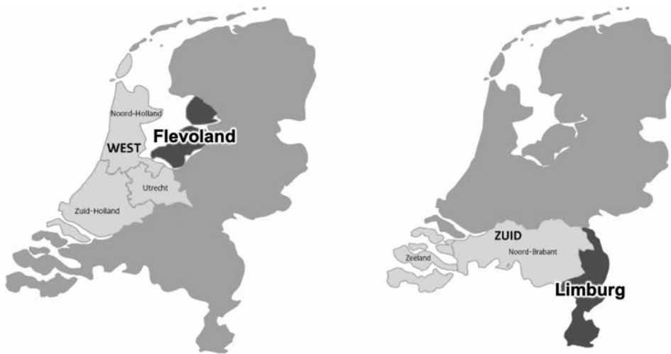
Figure 2. Case study regions as part of the ROP areas: Limburg (dark grey on the right map), Flevoland (dark grey on the left map).

These two cases were selected because of the relevance of Cohesion Policy for them: for Flevoland, Cohesion Policy matters because of its former Objective 1 status and its substantial inflow of EU funding; whereas for Limburg, Cohesion Policy is highly relevant due to its geographic position and strong engagement in cross-border cooperation programmes supported by this policy. The following section offers an analysis of this rich empirical material, while the concluding section discusses them against the background of existing literature.