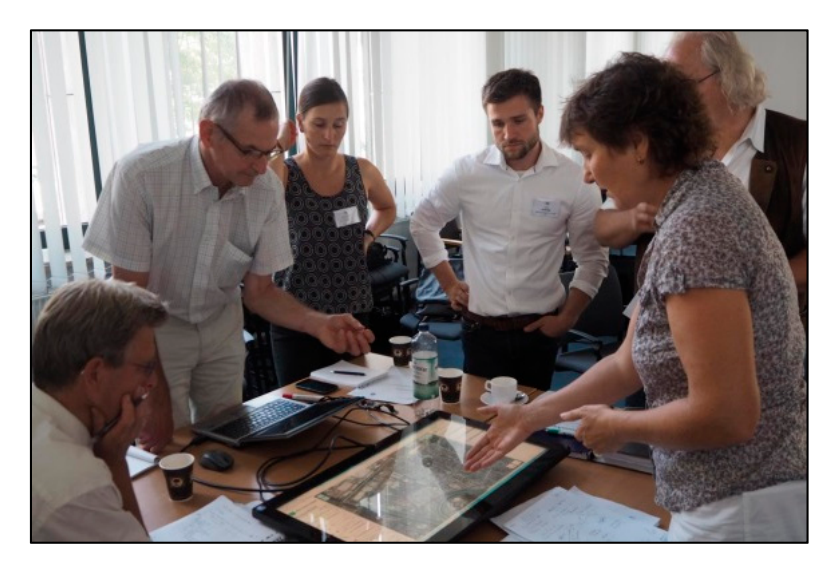
Figure 3. Participants working with the Adaptation Support Tool in the design workshop for Moabit West, Berlin (used with permission from CHORA Conscious City, TU Berlin).

Observations, interviews, and questionnaires were used to evaluate the workshop process, using the inductive, deductive, and meta analyses (Table 4).