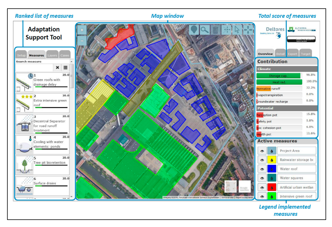
Figure 2. Interface of the Adaptation Support Tool and its three panels.

The Adaptation Support Tool (AST) is a web-based PSS for planning nature-based and traditional infrastructure spatial adaptation measures in the urban environment (Figure 2). The AST is designed for use in facilitated workshops, where small groups of stakeholders co-create spatial adaptation plans at the neighbourhood to city scale. More information on the AST can be found in van de Ven et al. [6].