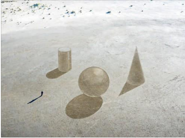
Figure 2. Sand drawings on the Sand Engine by Nico Laan. Title: Geometric Illusions, June 2021, 60 × 40 metres.