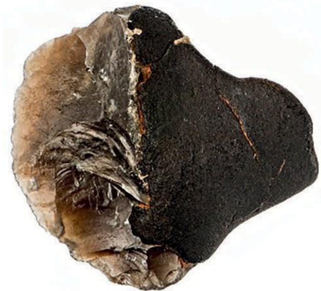
Figure 3. Neanderthal flint with birch pitch found at the Sand Engine.

Amongst the most special findings is a piece of flint with birch pitch (see Figure 3). This 50,000-year-old artefact has changed our current view on the Neanderthals. It indicates a higher level of intellectual capacity than assumed so far because producing the birch pitch requires an understanding of chemical and technical processes, particularly in an era where trees were not abundantly available (Niekus et al., 2019). Other findings, including human bones, spearheads and tools from the Mesolithic period, demonstrate that humans were already regular inhabitants of the Netherlands after the last Ice Age.