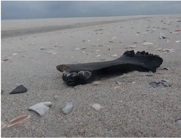
Figure 4. Fragment of the mandible of a giant deer found at the Sand Engine.

Fossils of fauna up to 120,000 years old have been found. These include fish and bird species, and sea and land mammals from the Pleistocene and Holocene periods, such as the steppe wisent and the woolly rhinoceros (see Figure 4 for an example of a finding). Important insights include: that the giant auk was part of the ecosystem of the North Sea (Langeveld, 2020); that the monk rook that now only lives in the Mediterranean is tolerant to colder conditions (Mol & Langeveld, 2017); and that the red deer still exists thanks to its ability to adapt its diet to new circumstances (Langeveld et al., 2020). Other animals that were less able to change their diet like the steppe wisent became extinct (Van Geel et al., 2019). The development of new research methods, such as studying the pollen in fossil molars to learn about the diets of animals, underlies the development of these new insights.