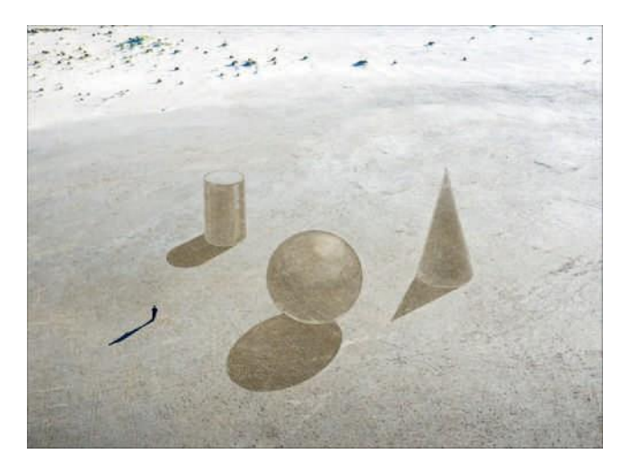
Figure 2. Sand drawings on the Sand Engine by Nico Laan. Title: Geometric Illusions, June 2021, 60 \times 40 metres.