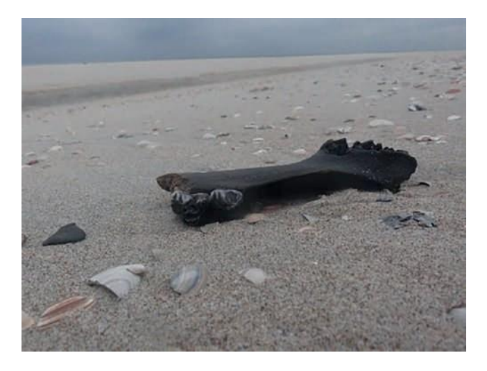
Figure 4. Fragment of the mandible of a giant deer found at the Sand Engine.

Fossils of fauna up to 120,000 years old have been found. These include fish and bird species, and sea and land mammals from the Pleistocene and Holocene periods, such as the steppe wisent and the woolly rhinoceros (see Figure 4 for an example of a finding). Important insights include: that the giant auk was part of the ecosystem of the North Sea (Langeveld, 2020); that the monk rob that now only lives in the Mediterranean is tolerant to colder conditions (Mol & Langeveld, 2017); and that the red deer still exists thanks to its ability to adapt its diet to new circumstances (Langeveld et al., 2020). Other animals that were less able to change their diet like the steppe wisent became extinct (Van Geel et al., 2019). The development of new research methods, such as studying the pollen in fossil molars to learn about the diets of animals, underlies the development of these new insights.