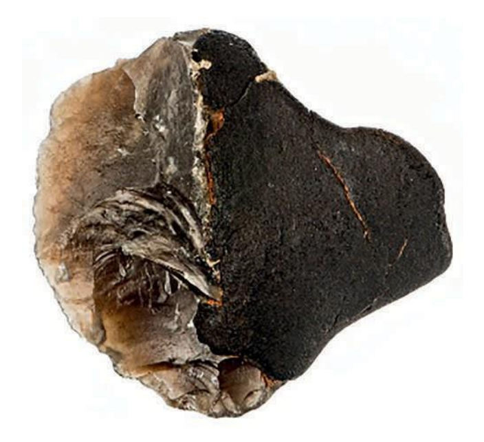
Figure 3. Neanderthal flint with birch pitch found at the Sand Engine.

Amongst the most special findings is a piece of flint with birch pitch (see Figure 3). This 50,000-year-old artefact has changed our current view on the Neanderthals. It indicates a higher level of intellectual capacity than assumed so far because producing the birch pitch requires an understanding of chemical and technical processes, particularly in an era where trees were not abundantly available (Niekus et al., 2019). Other findings, including human bones, spearheads and tools from the Mesolithic period, demonstrate that humans were already regular inhabitants of the Netherlands after the last Ice Age.