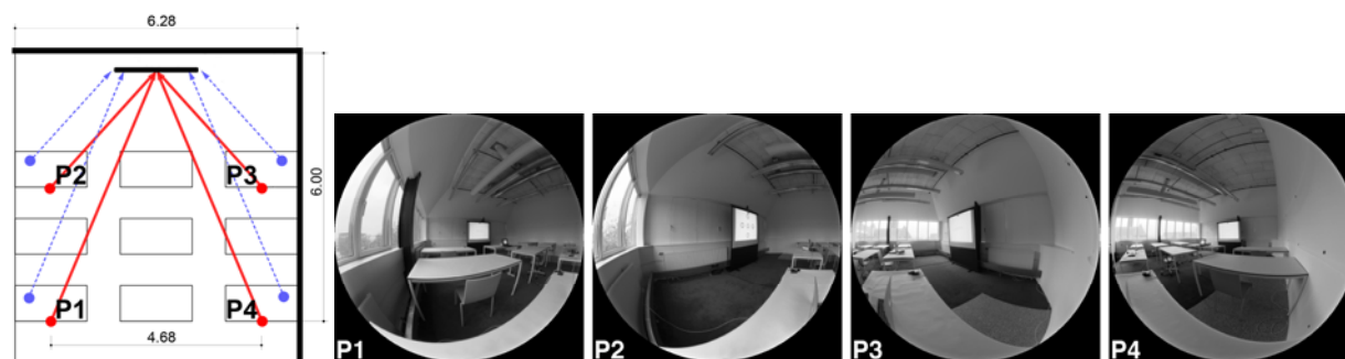
Figure 1 – Plan view of the room (left) and views from the 4 positions (right)

For the purpose of this study, only the part of the questionnaire concerning the reported visual discomfort from window glare is analysed. The question was formulated as: “When doing the test in this position, which degree of glare from the window have you experienced?”