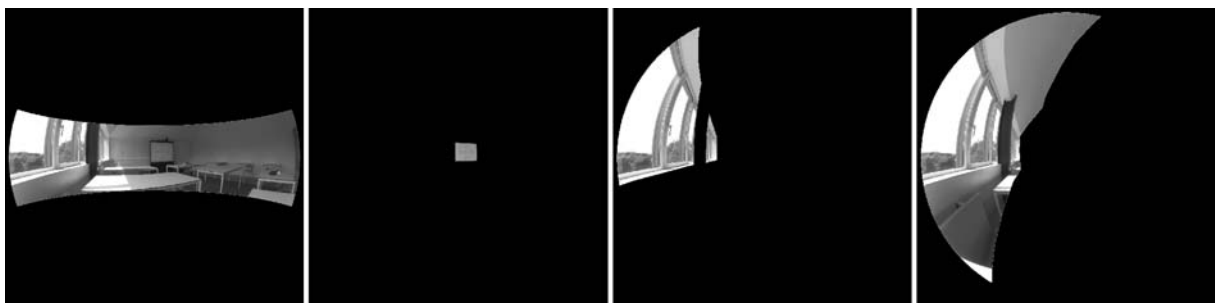
Figure 3 – 40^\circ band, task, window and window-adjacent-media region masks, for position 1

Evalglare provides the possibility to calculate the luminance statistics for some pre-defined regions (e.g. 40^\circ band) or for any other region specified by a mask file. The task, window, window-adjacent-media mask files for the four positions were provided to the programme for the calculation of the luminance in these regions (Figure 3).