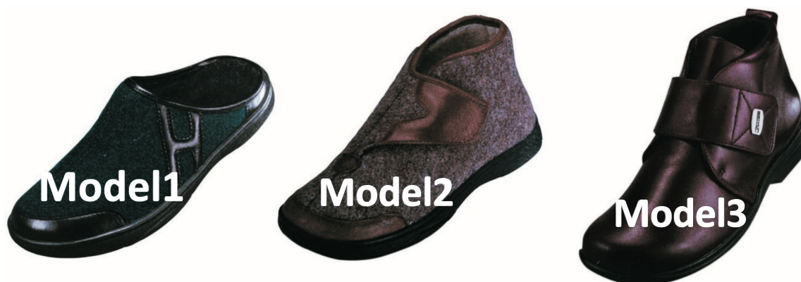
Fig. (1). Shoe models 1, 2, and 3.

In the current market of shoes there are several solutions to make a shoe fit to the foot shape.