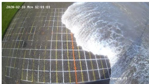
Figure 3 - Snapshot of a very oblique wave running up the slope during storm Ciara.

The focus of the paper will lie on the measurements performed during storm Ciara. Storm Ciara was an extratropical cyclone that hit large parts of northern Europe starting on 7 February 2020. Measurements were performed from 10 to 12 February 2020. Ciara was the first actual storm that was measured with the laser scanner system, and immediately tested the system to the extreme. Ciara was a highly unique storm, with offshore directed wind at the measurement location and waves that turned somewhat on the shallow flats in front of the dike to become almost alongshore directed waves at the dike. Hence, Ciara caused highly complex conditions at the measurement location with very oblique wave attack with angles of incidence up to 75°. This posed large challenges for measuring e.g. the 3D front velocities and the overtopping volumes and discharges, also see Figure 3.