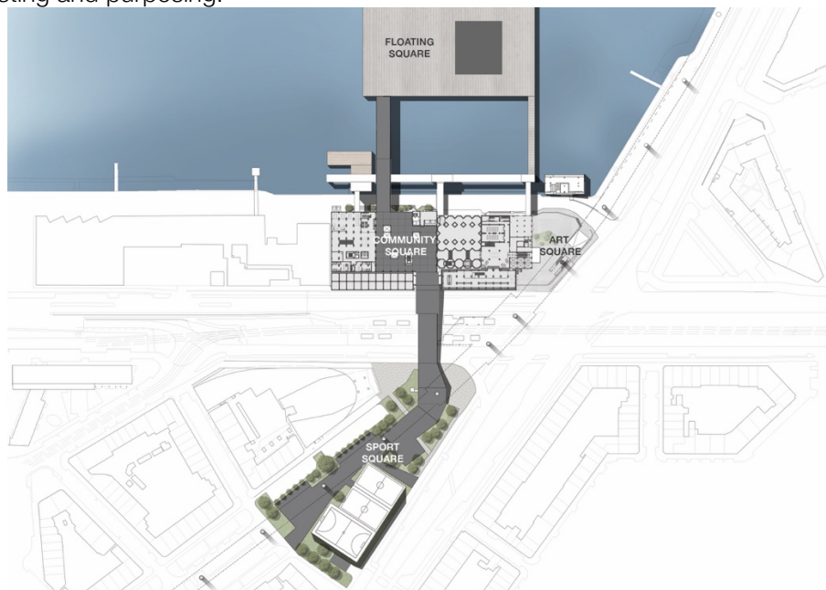
Fig. 02 The boundary of the site was extended to the south creating the square and connection to the building to increase the quality as a whole.