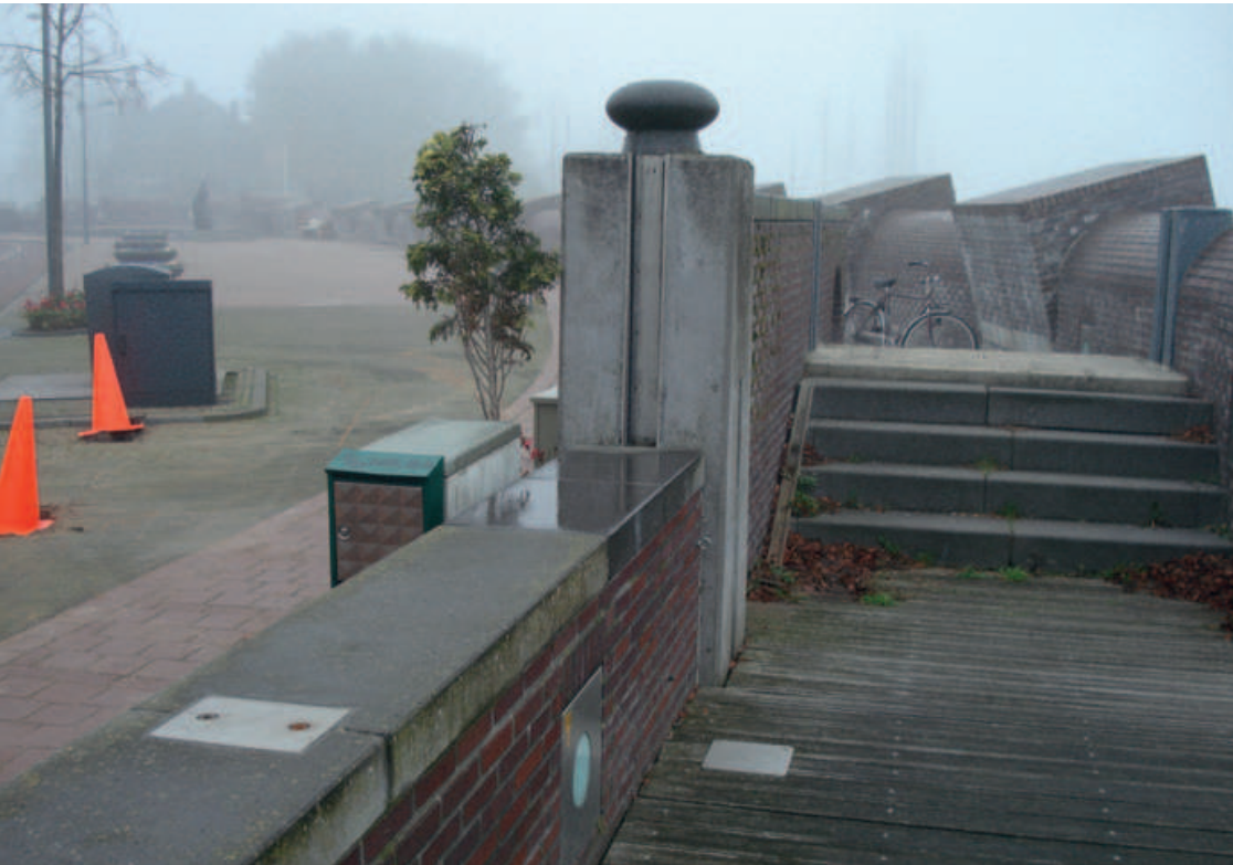
Figure 4. MFFD Kampen, touristic walkway integrated in flood defense structure

familiar structures), because this would spoil the creative phase and likely lead to suboptimal solutions. The analysis phase includes an inventory of stakeholders, boundary conditions, prevailing laws and regulations, requirements, spatial aspects, and risks.