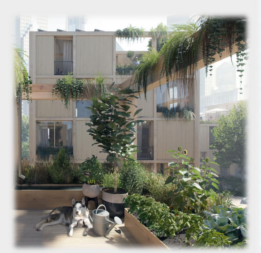
("The Urban Village Project", 2022)