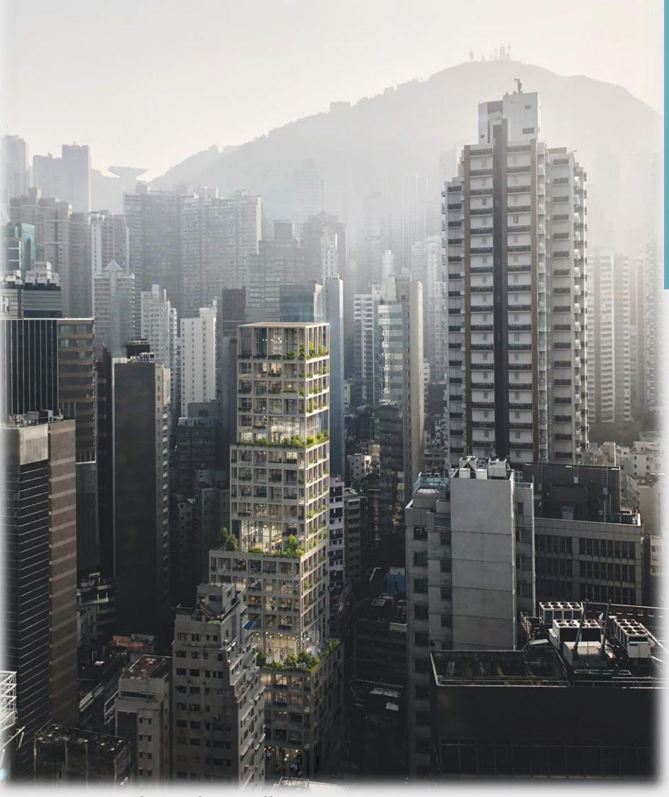
("The Urban Village Project", 2022)