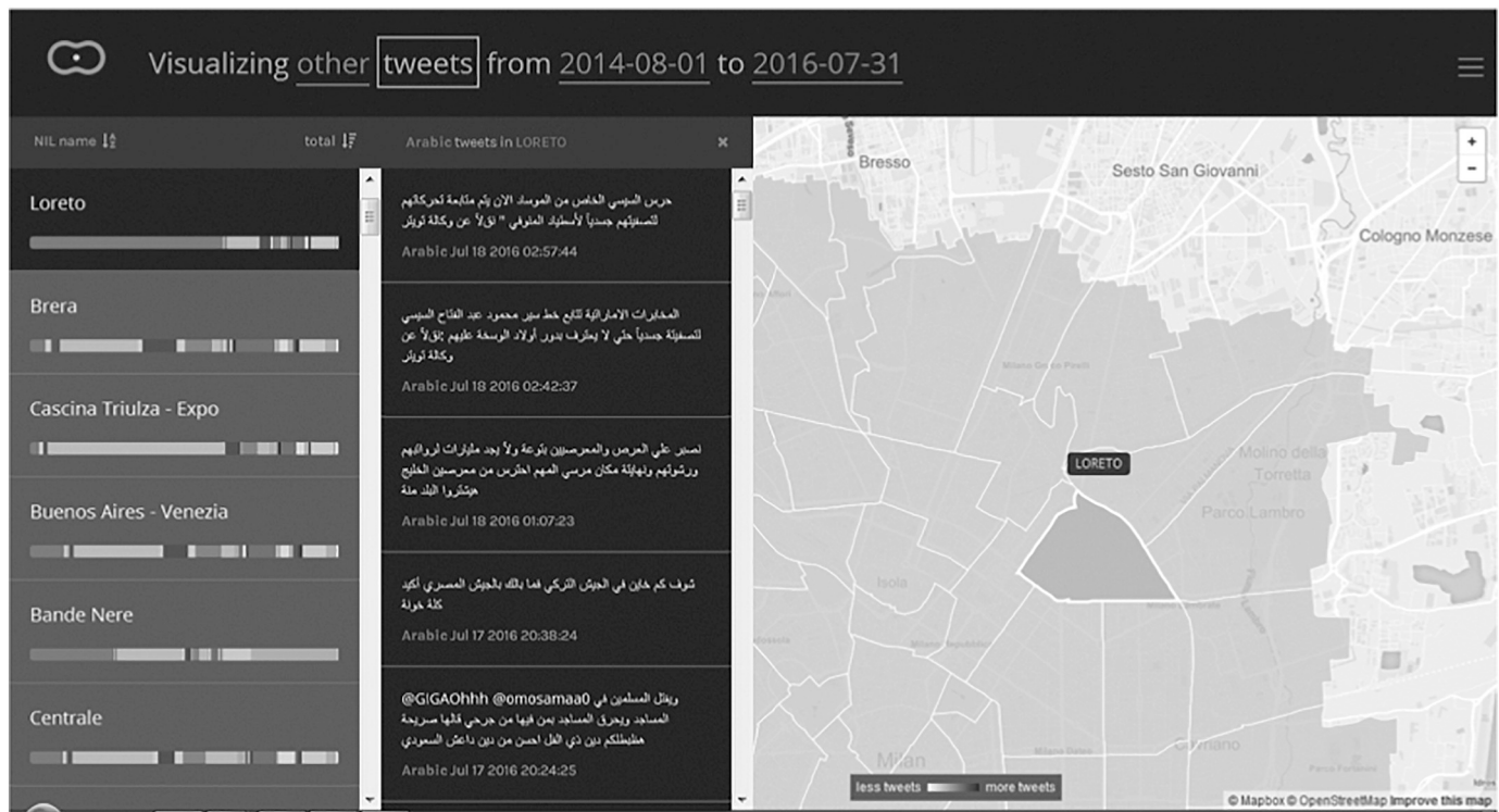
Fig. 2. An example of data visualization for the project.

solution was to use diverse lenses to represent the city, so as not to overstretch data fusion. For example, the initial decision to analyse census, phone and Twitter data together was abandoned.