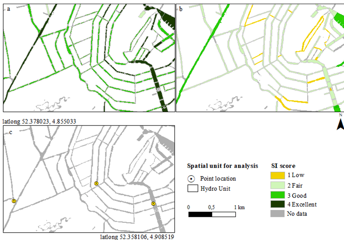
Fig. 3. Application of the SIs provides spatial information about the suitability of urban surface water for individual use functions in a comparable way. This is illustrated by the SI scores for TEE (a), Transport (b) and Recreation (c) for part of the city centre of Amsterdam. See Supplementary material Fig. S1 for full maps and Supplementary material DS1 for all data per HU or point location.