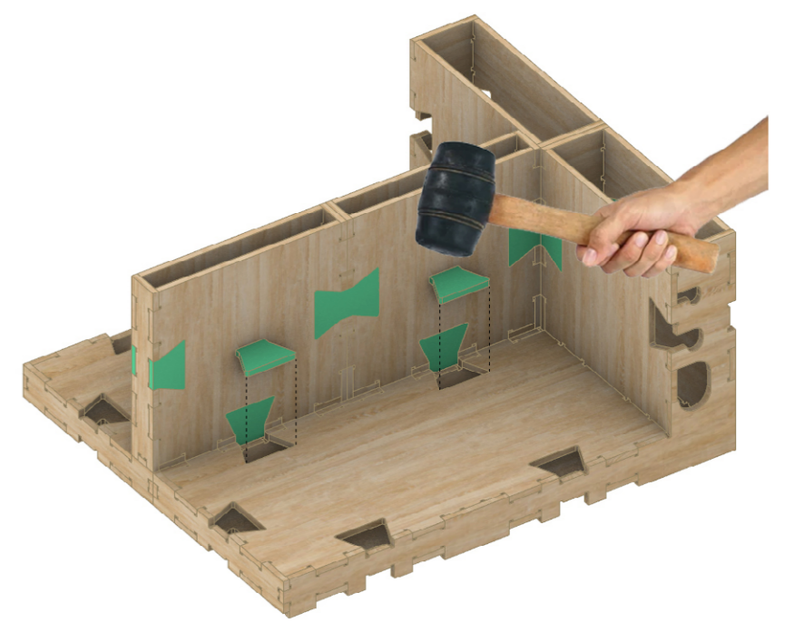
4 / Wall connection