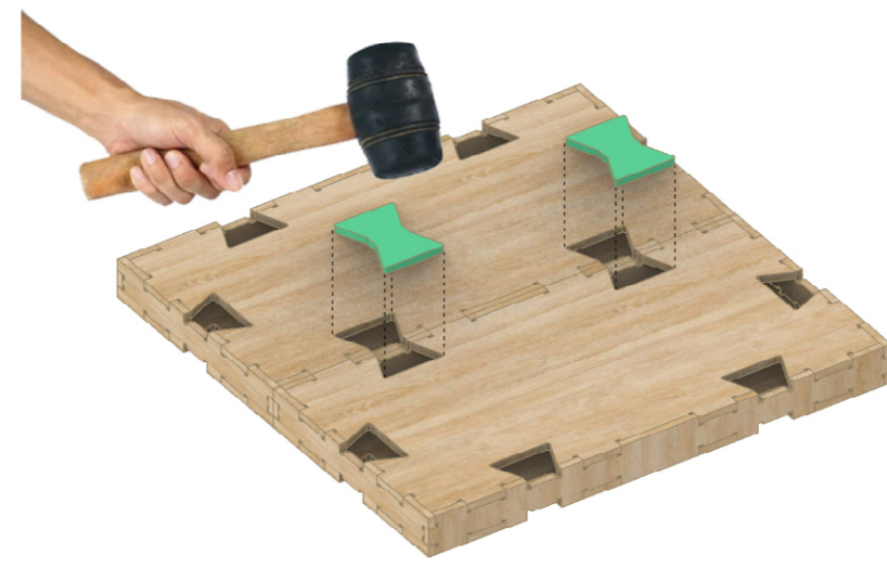
3 / Two modules connection