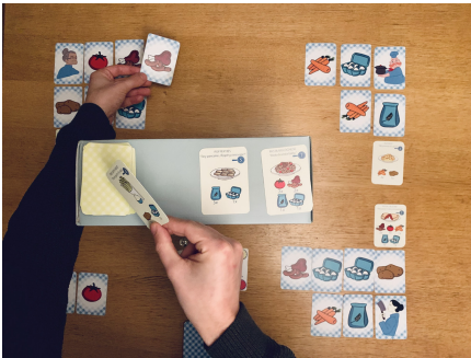
Fig. 1. Screenshot of the playing table

debriefing, the players reflect on this. With the help of the facilitator, the players relate their experience in the game to the invisible PD symptoms and to the importance of cues that can help people with PD. A game session consists of two games of Cue Kitchen followed by a debriefing. Each game play takes 30–40 min and the debriefing takes about 30 min.