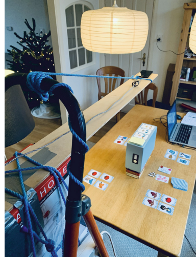
Fig. 2. Experimental setup

In a mediated session, all players can see the playing field of the game on their screen (Fig. 1), including the playing cards. By giving the facilitator directions for their desired actions, they participate in the gameplay. To achieve this, the software of Big Blue Button has been used. This is an open-source web conferencing software, similar to Zoom, specially set up for TU Delft for educational purposes 1 . To make a mediated environment possible, no professional tools have been used, but only day-to-day objects that are available to everyone. The playing table was filmed using a smartphone and a construction made of kitchen stairs, some books, rope, tape, and a bookshelf (Fig. 2).