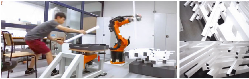
Fig. 1.1 Human-assisted robotic assembly of non-uniform linear elements implemented with PhD and MSc students

Considering the 50% of tasks that cannot be completely automated, robots will not replace humans but rather support them by taking over repetitive and/or heavy tasks. The human role will be mainly focused on envisioning new forms of physical environments and advancing novel means for their construction and operation as well as supervising and intervening when the non-human agents require assistance. This implies that cyber-physical systems integrated into buildings and building processes will increasingly share agency in the use of means of production and space.